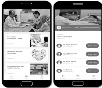
Figure 3: Interface Application