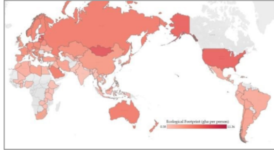
Fig. 2. Spatial distribution of the ecological footprint (per person). Darker red areas represent higher values