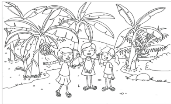
Fig 2:- Illustration Lusi, Santi, and Mira while playing together in the yard around the house are still many garden plants

Created as an illustration of the playground setting in the month in this study is still depicted in the home yard and added the atmosphere of the living room or the typical Balinese house terrace. Illustration used in accordance with the visual reference Figure 2. The following illustration sketch is made: