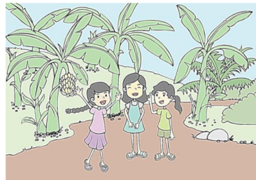
Fig 4:- One example of basic coloring on an illustration sketch that will be used on material content.

The process of planning in the illustrations to be included in Chapter 9 refers to the visual reference shown in Figure 4. The color of the soil used is the brown color of the soil or usually people call the red soil for the characteristic of the land in the area of Jakarta. The colors used for the color of the characters are used soft colors. This coloring process through the process of digital coloring using adobe photoshop software or adobe illustrator.