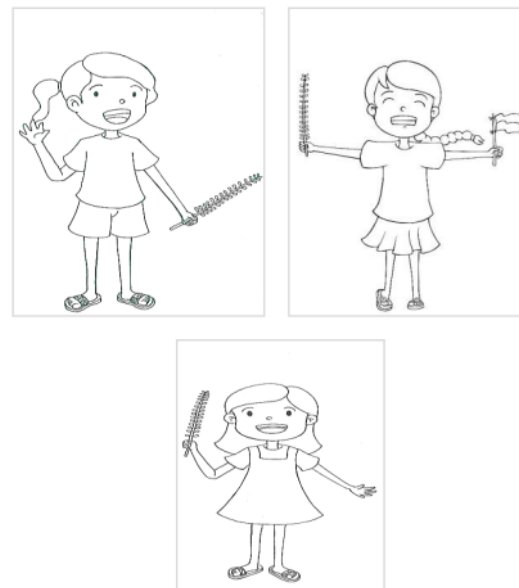
Fig 1:- Sketches of characters from left to right: Lusi, Mira, and Santi

Shown in Dampu Moon game story there are three girls. Illustrated peer-style, well-dressed and fully-fledged shoes are playing on a page. The three daughters are named Lusi, Mira, and Santi. In the book is not shown or written which one is Lusi, Mira, and Santi. It can only be seen from the way Indonesians read left to right. So Lusi can be perceived to the far left, the middle Mira, and then the last Santi on the right.